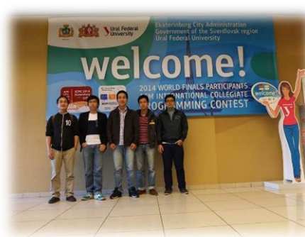
ACM/ICPC World Final in Ekaterinburg, Russia. (June 2014)