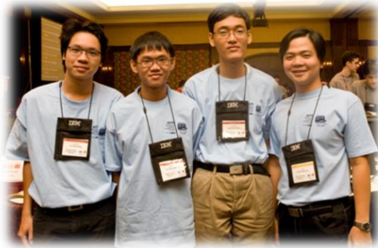
ACM/ICPC World Final in Canada (2008)