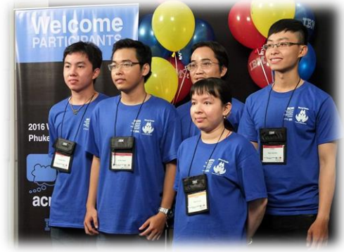
ACM/ICPC World Final in Phuket, Thailand (2016)