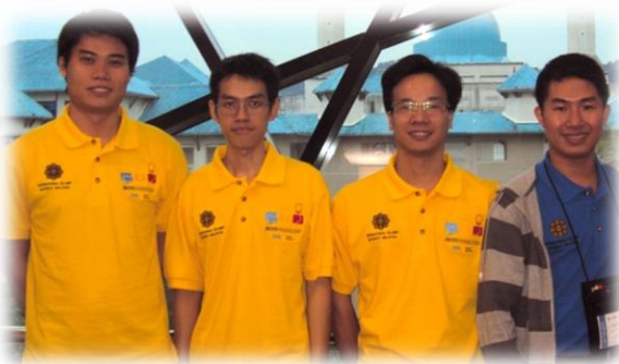
ACM/ICPC World Final in Orlando, U.S.A (May 2011)