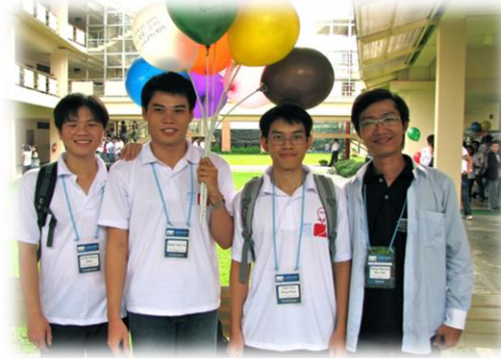
ACM/ICPC World Final in Harbin, China (2010)